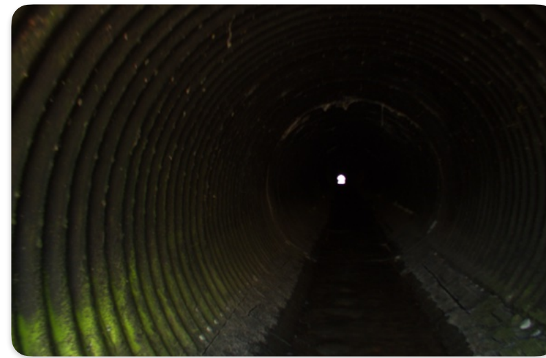
Images with 3 configurations as the robot enters the culvert